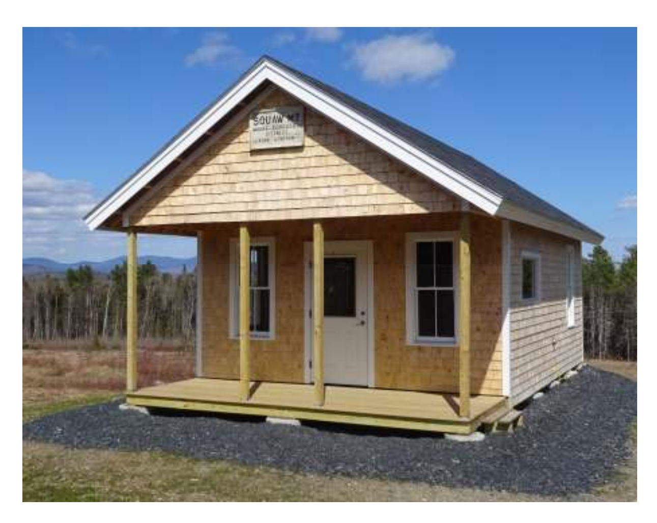
The new camp at the Greenville Visitor's Center

We continue to partner with The Natural Resource Education Center (NREC) based in Greenville Maine, on a project to add a watchman's camp replica at the Greenville Maine Visitors Center. This year, we worked with the volunteer team that built the camp on planning out the interior. The vintage interior was built out, but the camp was not opened yet. We will be populating the camp with 1960 period items this spring/summer with a grand opening being planned for mid-late summer 2020.