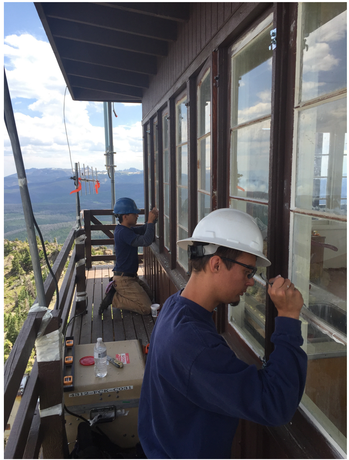
Collbran Job Corps Center workers helping Historicorps