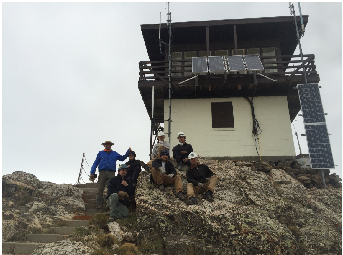
Minor electrical work to be finished in 2017. Below grade vault toilets are completed, will get above grade completed 2017. Roof Doors and interior work completed in 2016.